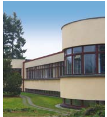
Our carbide production in Berlin

Guhring has developed an ultra-fine grain carbide that perfectly meets both criteria - high break resistance and high wear resistance which open up new possibilities for the application of solid carbide taps.